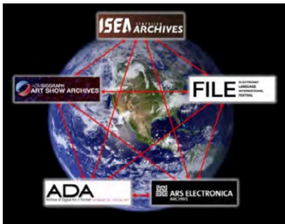
Figure 1: A vision of the initial international archives network (picture source: MITCHELL et al., 2022b, p. 456, fig. 1).

Media Art archives (Figure 1) (MITCHELL et al., 2022b, p. 455). The core group of this network includes the archive of the International Symposium on Electronic Art (ISEA, currently headquartered at the University for the Creative Arts in the United Kingdom), the ACM SIGGRAPH Art Show Archive of the Association for Computing Machinery (ACM, based in the U.S.), Festival of Electronic language (FILE, based in Sao Paulo in Brazil), and the Austrian Ars Electronica Archive based in Linz and ADA (MITCHELL et al., 2022b, p. 456–459). 8 This initiative was included in the 2019 LeFo project grant application and has been supported since the project began.