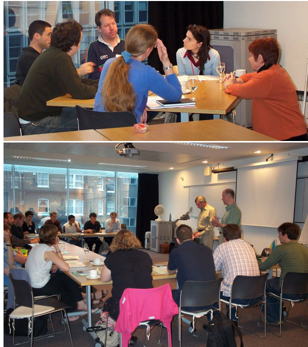
Figure 2: Two CASLAT sessions

Feedback from staff taking CASLAT has been generally positive. The following quotes about the impact of the programme are by no means unusual: